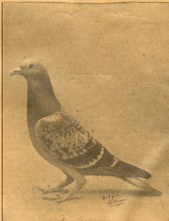
DOUBLE EVENT (Youngster). 12th Bath smash, six 1sts pools, 697 velocity; Bournemouth 2nd, all sections, 1534 velocity; 2nd Produce, etc. Daughter of Angouleme; at 10 years of age.

PLENTY CHEC. —1st Bath, six firsts pools, 1st Bournemouth, six firsts pools, Manchester F.C.