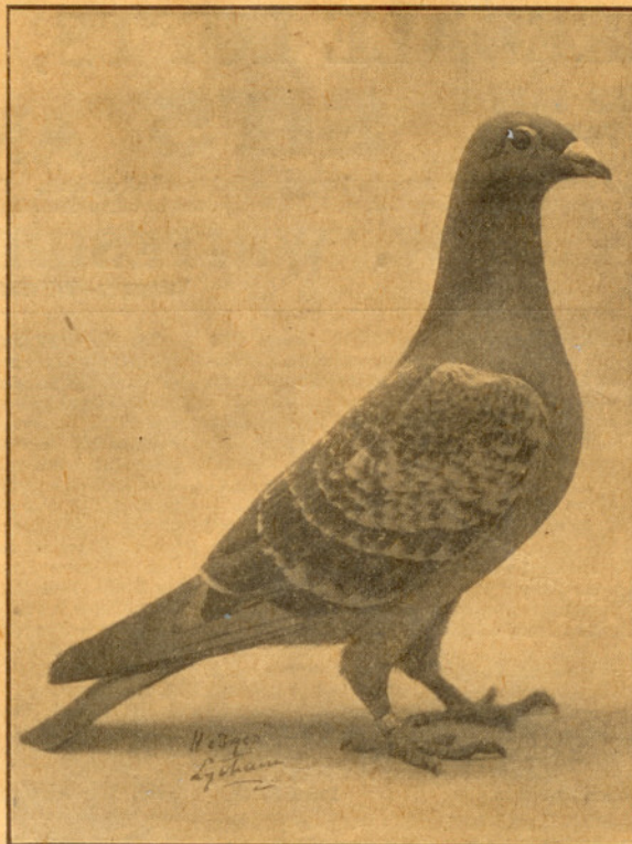
NEATY (Cock), 2 years. 1st hard Rennes, 942 velocity, Manchester F.C., all sections, by 14 minutes; six 1sts pools; awarded gold medal by National Homing Union, Rennes and Marennes.