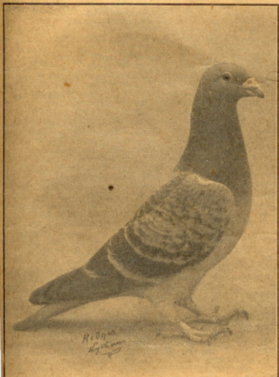
PICTURE (Cock), 2-year-old. £5 pool bird, Great Northern, 1922; Guernsey and Rennes, yearling; Guernsey and Marennes, 2 years old; good winner of many prizes.