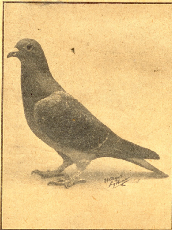
RECORD. World's Great Stock Pair.

Bleu , when paired to Record , hen of Record Pair, bred many winners, including Bronze Favourite , 1st Grand National Angouleme by over half-an-hour, 1,643 competing; Cigarette , 12th Grand National , two of six pigeons winning £4,000 in 8 days 1920, and with other brothers of the 25 birds winning in one season £9,400 . Plume Casse , Young Excellence , Favourite's Brother . Brothers winning £5,000 in one season, 1920.