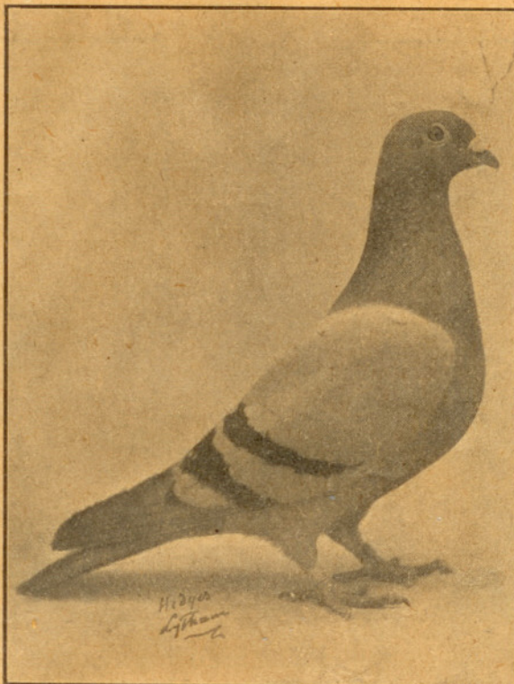
OLD BLUE HEN.

Photographed at 15 years old. Foundation of loft.