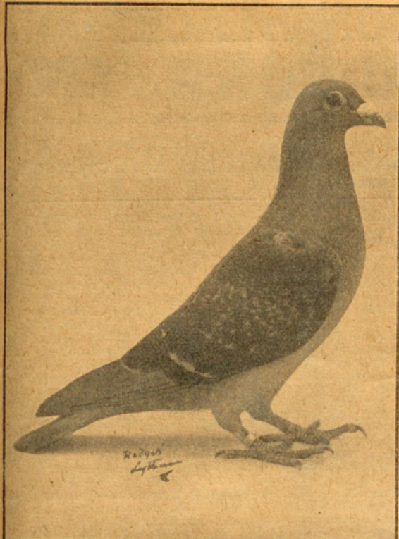
QUALITY (Cock). Yearling. 1st Stockport Fed., 1,380 birds competing, 1032 velocity; N.E. wind.