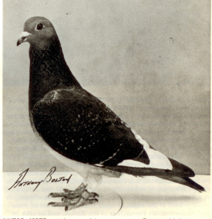
NU75P 43277, another promising young pure Gurnay, this is a daughter of 'Double 16'.